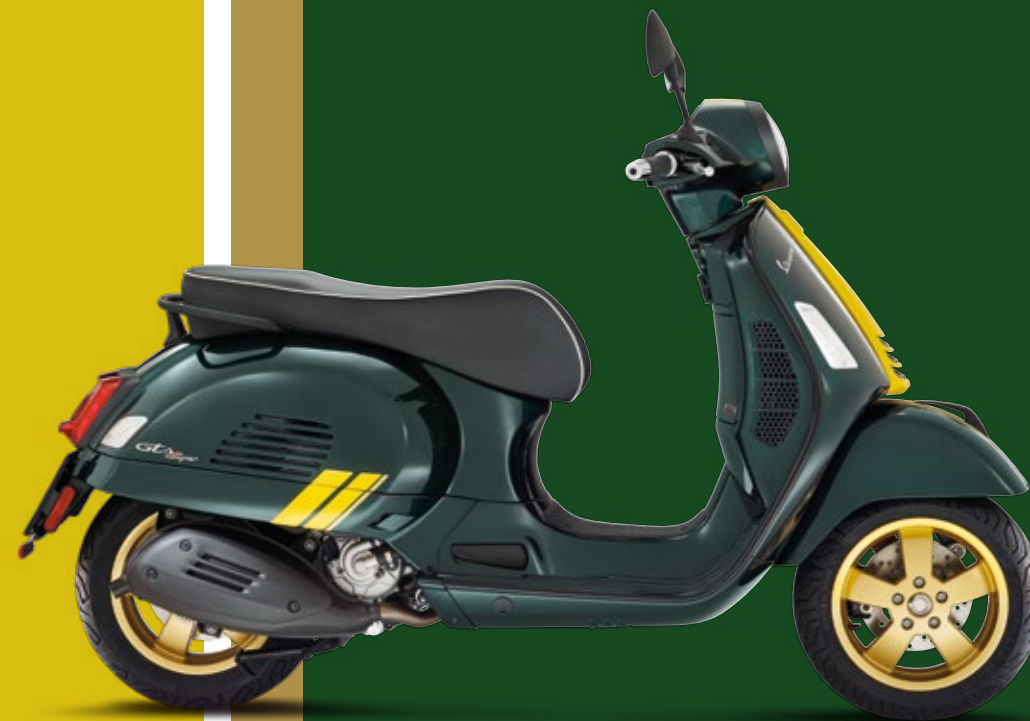
VESPA GTS SUPER RACING SIXTIES