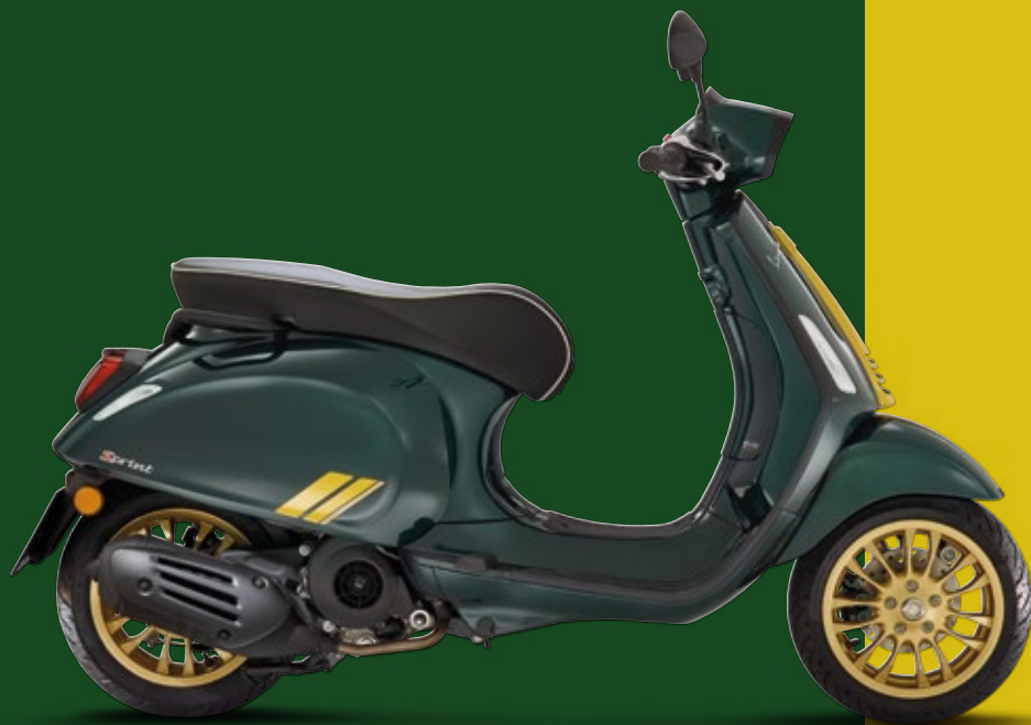
VESPA SPRINT RACING SIXTIES