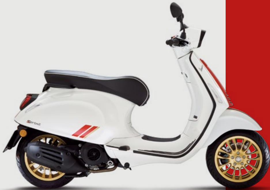
VESPA SPRINT RACING SIXTIES