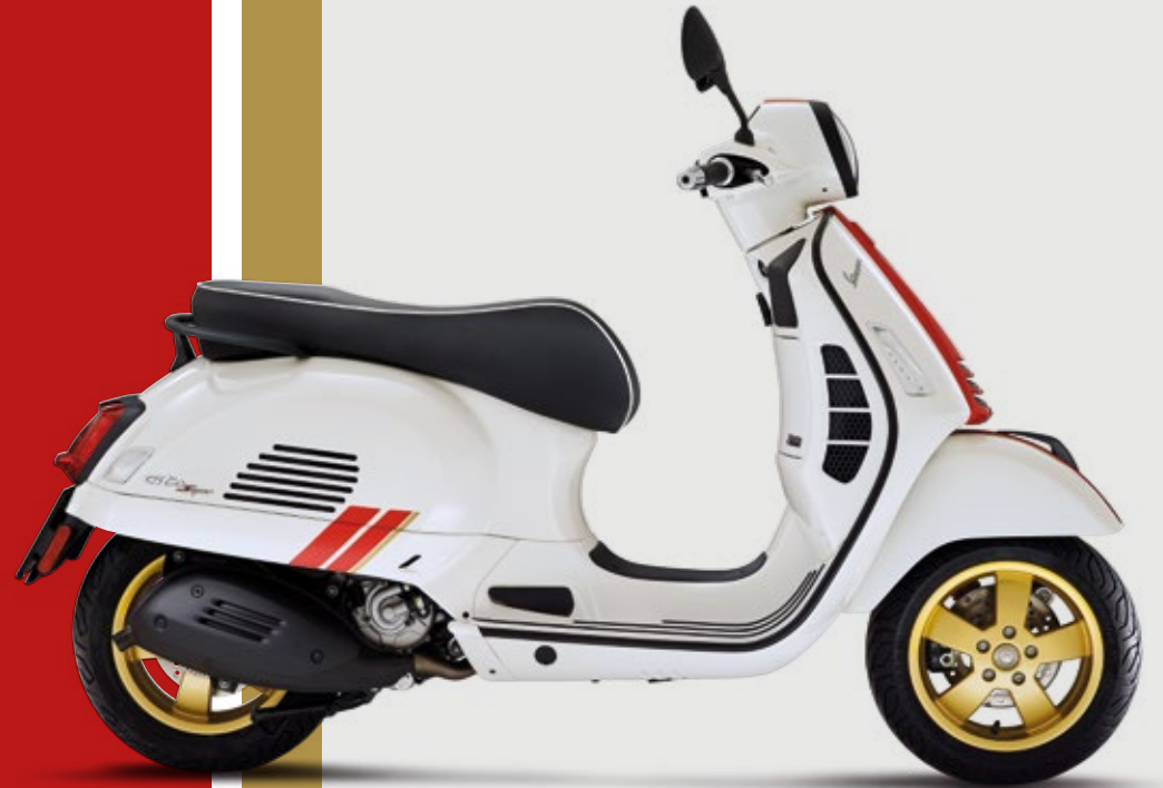
VESPA GTS SUPER RACING SIXTIES